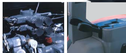
Auxiliary Remote Control Valve Lever

Two remote valves come standard on the M108S: a single- or double-acting changeable valve and a valve with a floating detent. The maximum installation is three valves (3rd flow control valve is available).