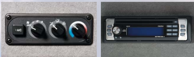
Superior Air Conditioner Radio/CD Stereo